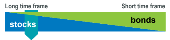
CDN LifePath 2040 Index NI Fund

Fund size (As of December 2025) C $ 253,986,932