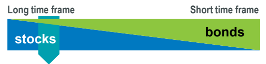
CDN LifePath 2040 Index NI Fund

Fund size (As of March 2026) C $ 270,623,544