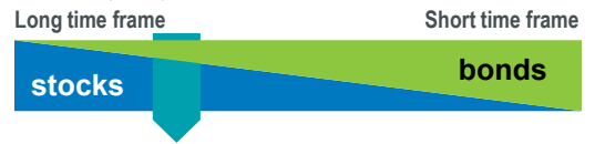
CDN LifePath 2035 Index NI Fund