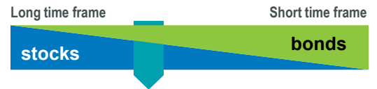
CDN LifePath 2030 Index NI Fund

Fund size (As of March 2026) C $ 216,611,097