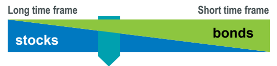
CDN LifePath 2030 Index NI Fund

Fund size (As of December 2025) C $ 208,264,565