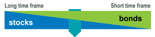
CDN LifePath Retirement Index NI Fund II

Fund size (As of December 2025) C $ 110,479,983